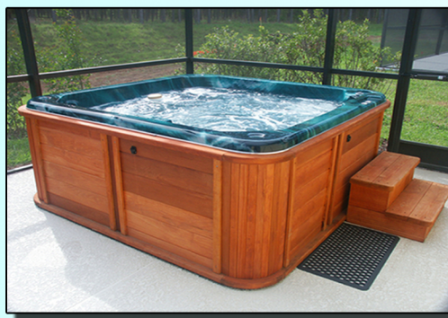
Treat hot tubs and garden furniture