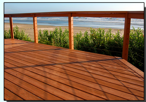
Transparent wood stain that won't disappoint