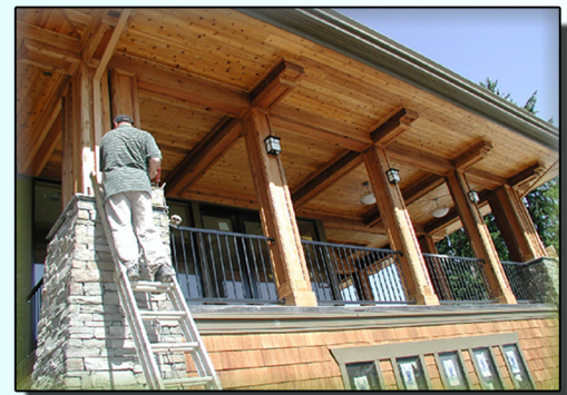
Protect wood ceilings and exterior soffits