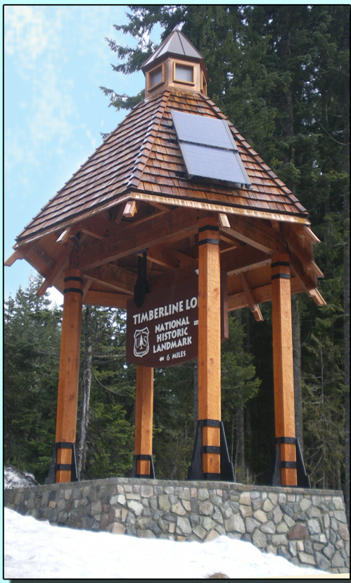
Stain and protect timber frame structures and gazebos